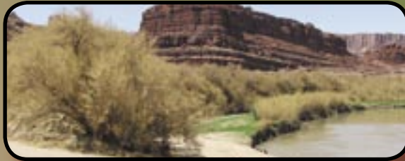
D. elongata feeding damage

The extensive invasion of saltcedar has justified the search for a suitable biological control agent. The saltcedar leaf beetle, Diorhabda elongata , has been tested for 20 years by APHIS and has been released at test locations in the western United States. At these test sites, it was demonstrated