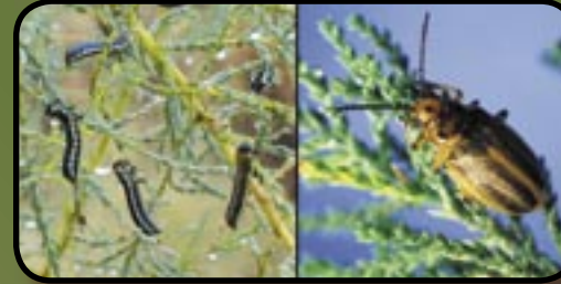
D. elongata pupae and adult

The saltcedar leaf beetles are yellow-brown and about ¼ inch long. Larvae feed on saltcedar foliage for about 3 weeks before crawling or dropping to the ground where