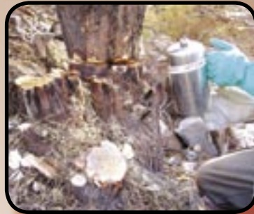
Cut stump application

Triclopyr and imazapyr are effective herbicides against saltcedar. Triclopyr is most effective in cut stump and basal bark treatments. Trees should be cut so that the stumps are two inches above the soil surface and the herbicide should be applied within a few minutes to the sides of the stump and the cambium layer. Basal bark applications can be applied any time of the year when the bark isn't wet or frozen. Herbicide should be applied from the ground up to 12-18" on all sides of the stem. Imazapyr treatments are most effective as foliar applications and provide the highest rate of saltcedar mortality at levels of 90 percent or greater. Fall applications in August or September produce the highest mortality rates.